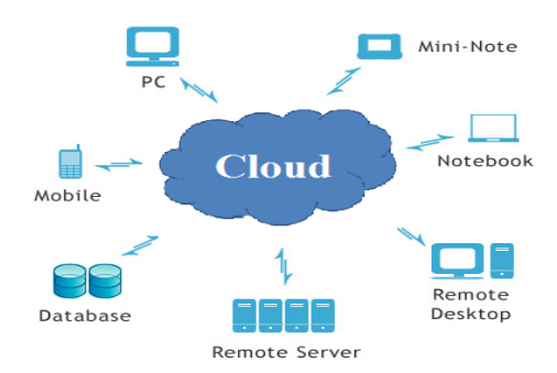
Figure 1: Cloud computing with different resource services.

is responsible for hosting of applications on the Internet for the users will follow the model called pay-per-use.